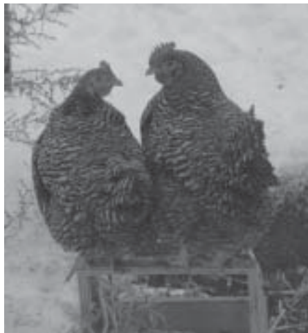
Check and Belle consider each other.

about noise, either assuming that all chickens crow or that roosters will be part of backyard flocks. However, very few North American municipalities allow roosters and only the bravest (or most foolish) among us would be tempted