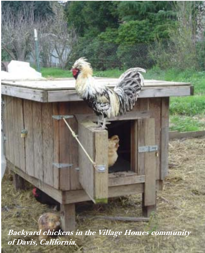
Backyard chickens in the Village Homes community of Davis, California.

So why all the flap over a few city chickens? The usual justification for prohibitive urban chicken bylaws can be grouped into three categories: